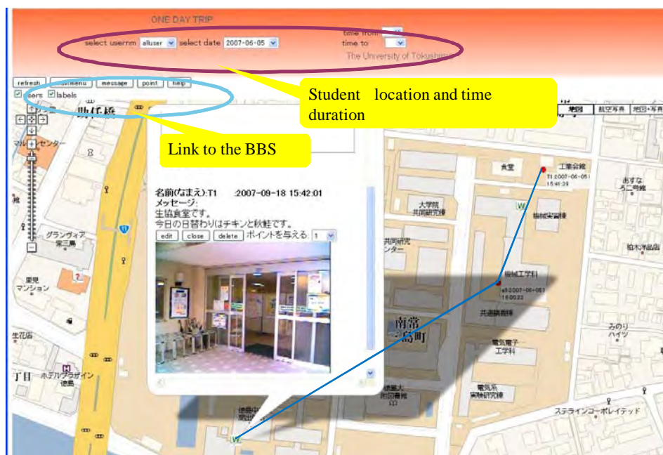
Figure 1: Map window for teacher.

the teacher to send messages to the students and also information linking to capture the learning status and activities of the students. A trace log of the student's movement is also saved in the server for future retrieval and reference.