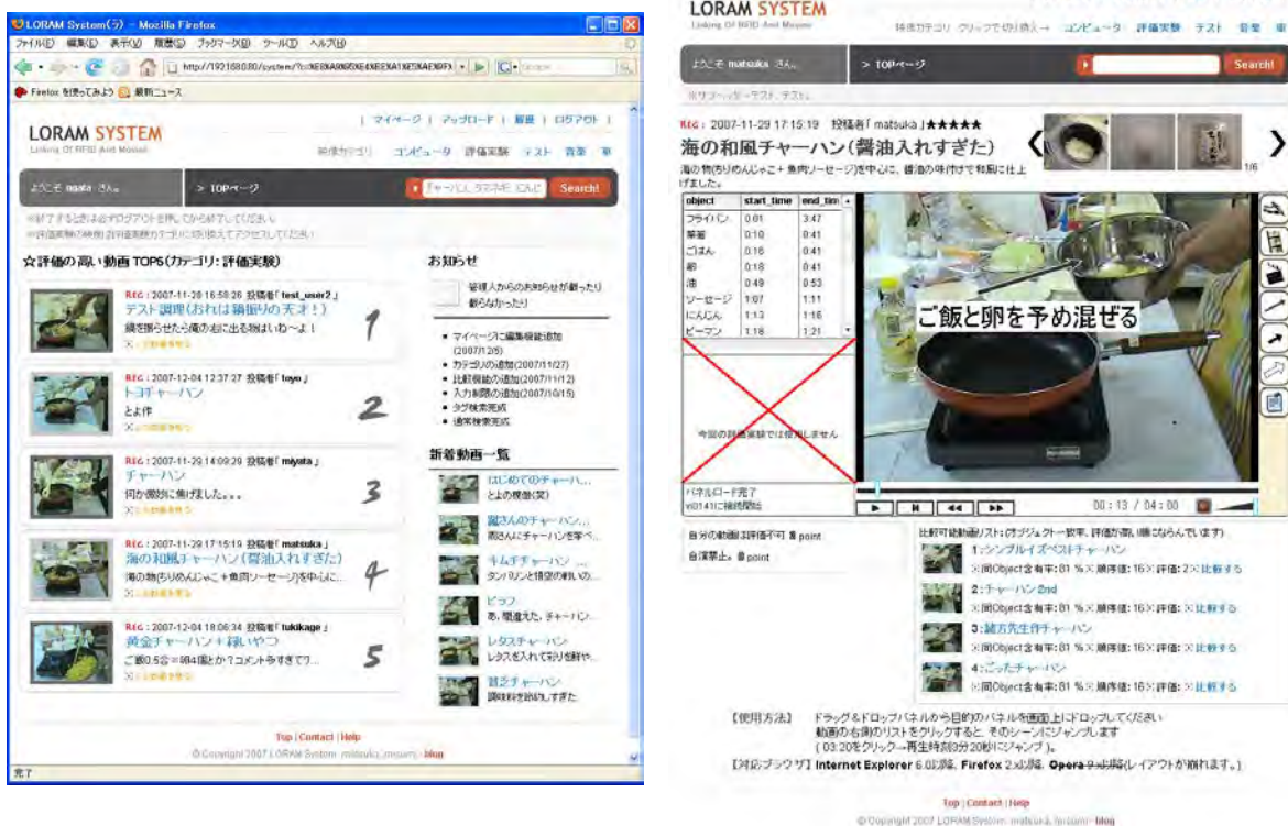
Figure 1: Video search interface (left) and video replay interface (right).

User can compare two different videos in the window as shown in figure 4. For example, the left is a video of an expert, and the right is a video of the user after the user watched the expert’s video. The tile of the video is shown in (A) and the video is replayed in (B). The timeline of the left video is shown in (D) and that of the right video is (E). In figure 4, the user can find that the timeline (E) took longer time than (D) and the work efficiency of the user is not good. On the timeline, a colored rectangle shows an object that the user used at the timing. If the mouse pointer is over the colored rectangle, the system shows the picture of the corresponding object in (F). Since the same object has the same color, the user can easily recognize when the object was used in the two videos.