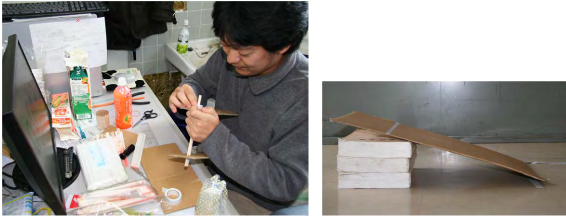
Figure3: Environment for the subjects (left) and the launching platform (right).