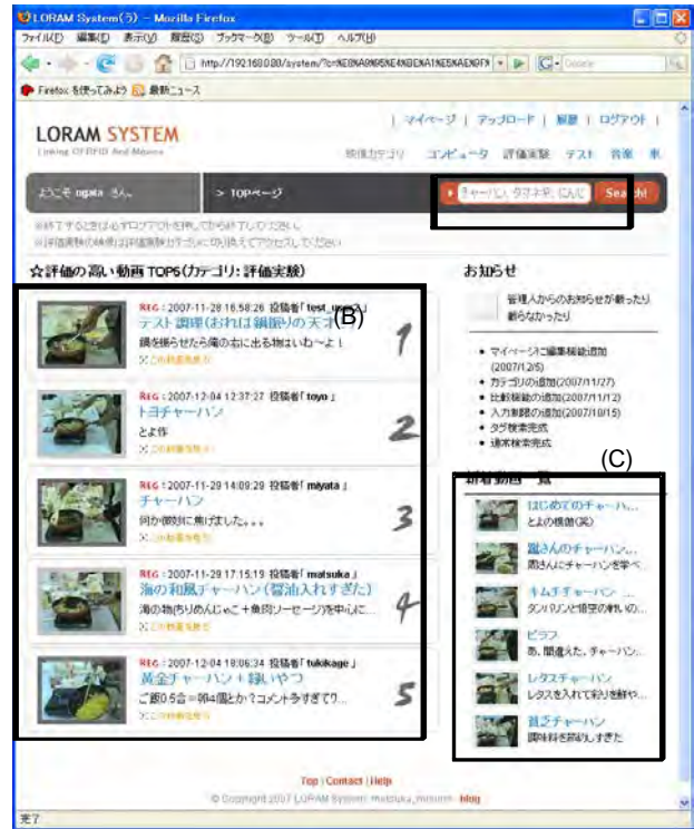
Figure 1. Video search interface.

items are shown in (F). By clicking one of the pictures, the system shows to the video segments that include the selected item. Playback (such as fast-forward) is controlled by the tool bar in (G). Videos similar to the playing video are listed in (H).