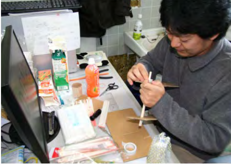
Figure 5. Environment for the subjects